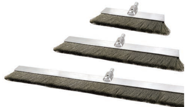
Flat Wire Brush Electrodes