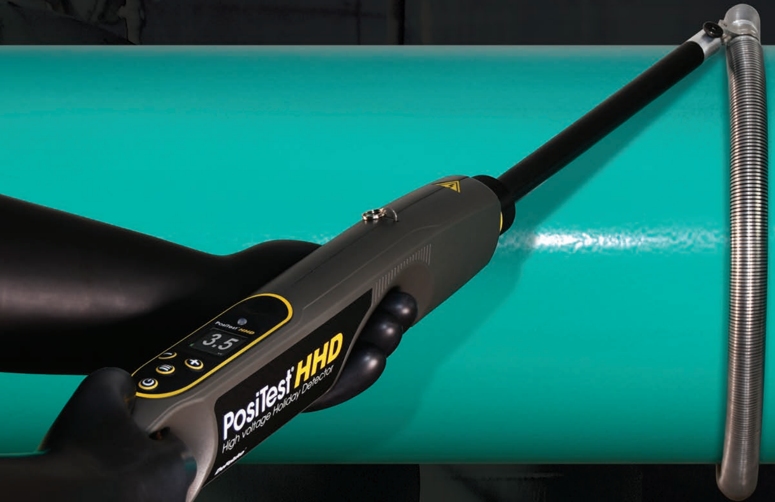
Optional handheld wand with insulated cable

Detects holidays, pinholes and other discontinuities using pulse DC